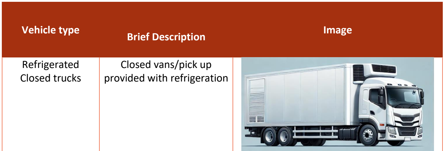
Table 2: Selection of Suitable Vehicles