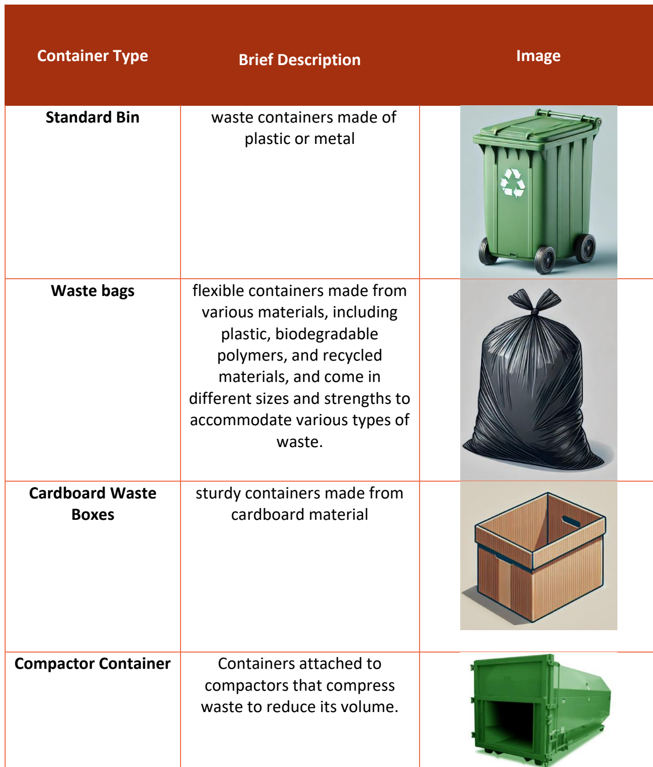
Table 3: Selection of Suitable Containers