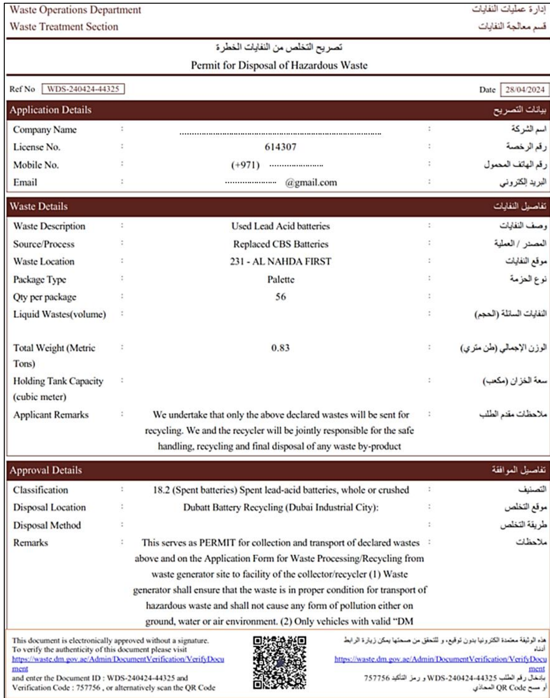
Table 6 Sample Permit for Disposal of Hazardous Waste to DM Accredited Recycler